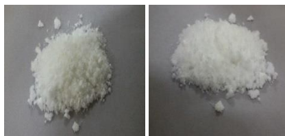
Figure 2. Organoleptic of chitosan microspheres with chitosan-tripolyphosphate ratio 1:2 (F1), 1:2.6 (F2)